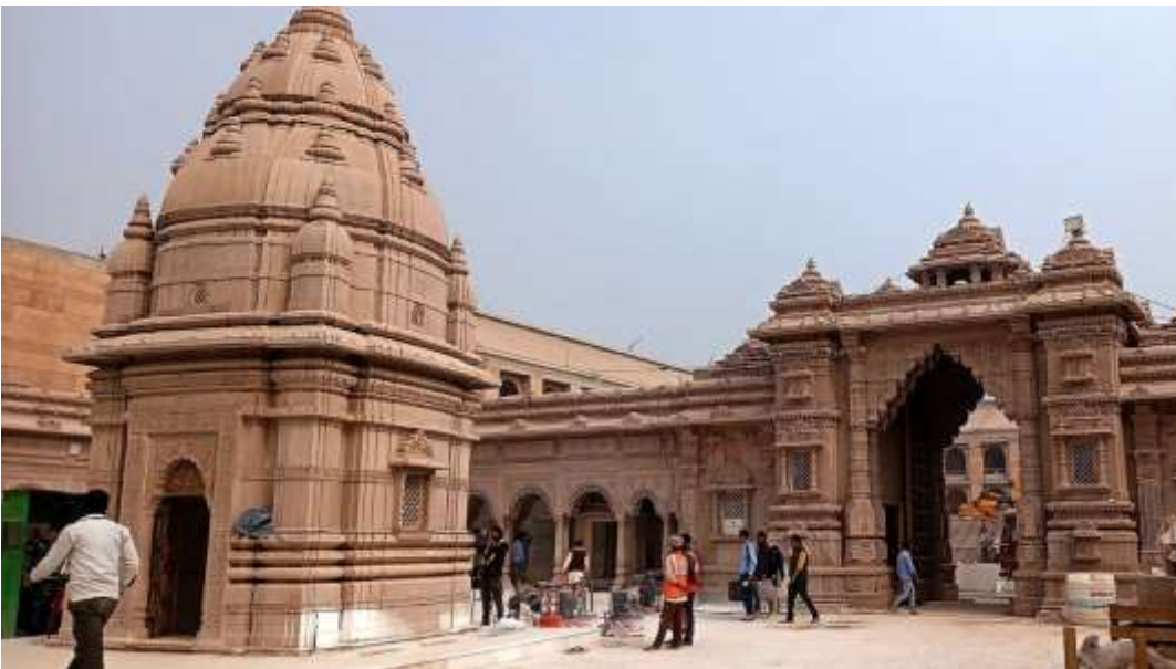
[Kashi Viswanath Temple after recent Development of Kashi Vishwanath Dham Project]

It is proposed to develop the new Sadan building with modern facilities, enabled with state-of-the-art ICT enabled features, but at the same time the external look of the building should match with the heritage look and typical characteristics of the historical buildings and landmarks in Varanasi. For a ready reference some of the heritage buildings in Varanasi are given in the following pages.