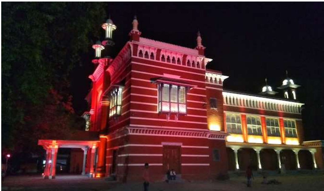
(Night view of the Town Hall Building at Maidagin area, Varanasi)

Until 2017, the council of Varanasi Municipal Corporation is to function from a building within the municipal corporation main building premises which was later dismantled to accommodate the construction of Rudraksh International Convention centre. Subsequently the Council moved to the heritage building of Town Hall situated in Maidagin area, and continuing from there as on date. Town hall building is a very old structure, renovated through GOI funded Hriday Programme, but due to its age-old construction lacks in many facilities required during the current time.