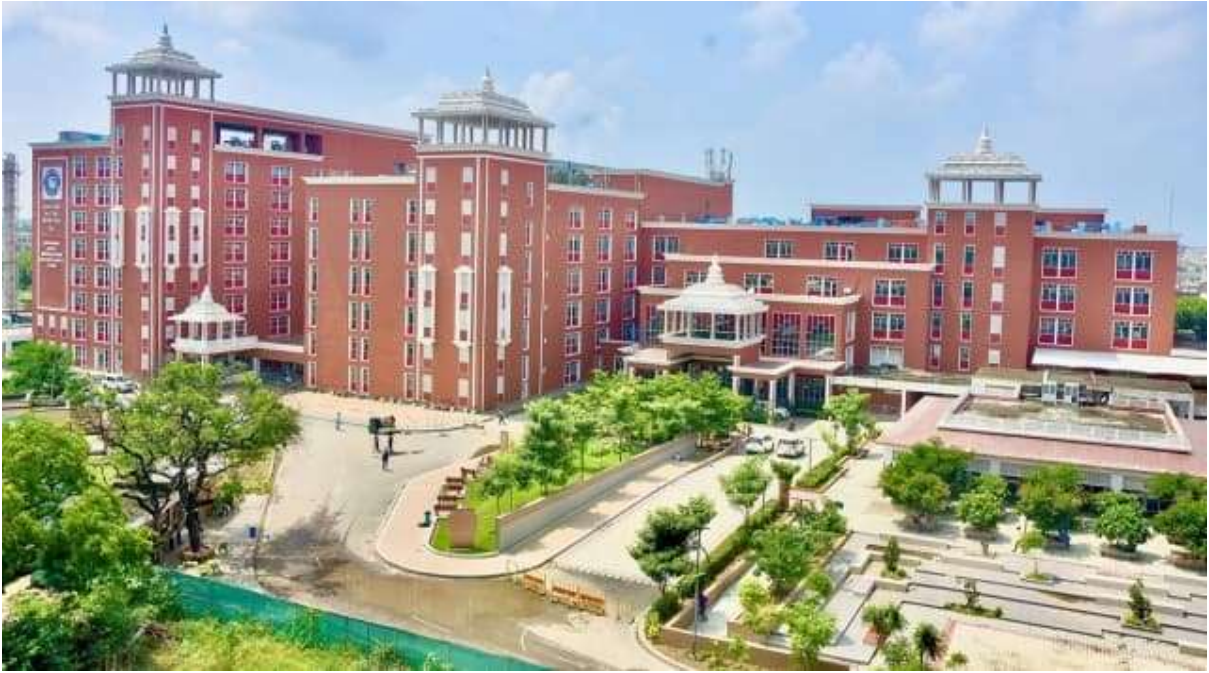
[Tata Cancer Hospital inside BHU campus premises, recently constructed]