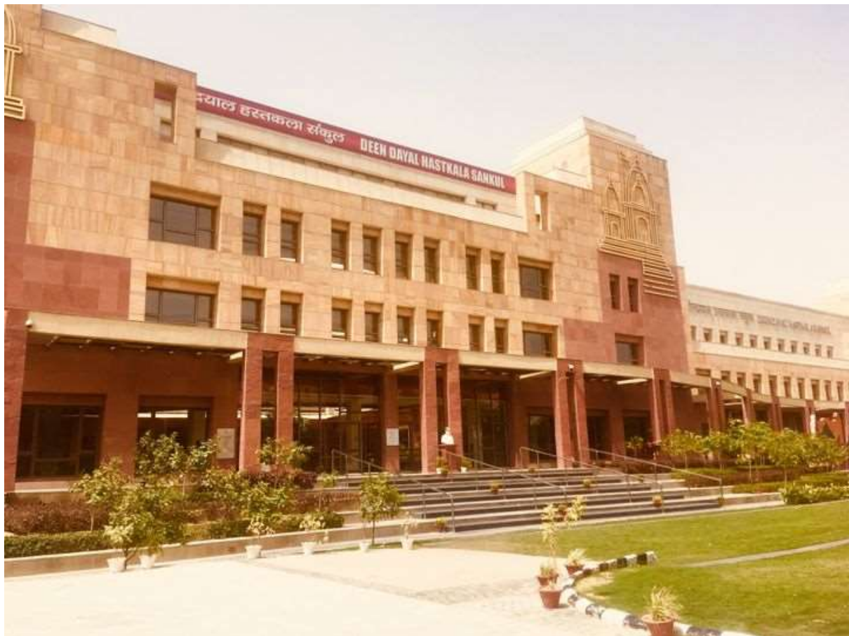
[Trade Facilitation Centre, Badalpur, Varanasi, recent construction]