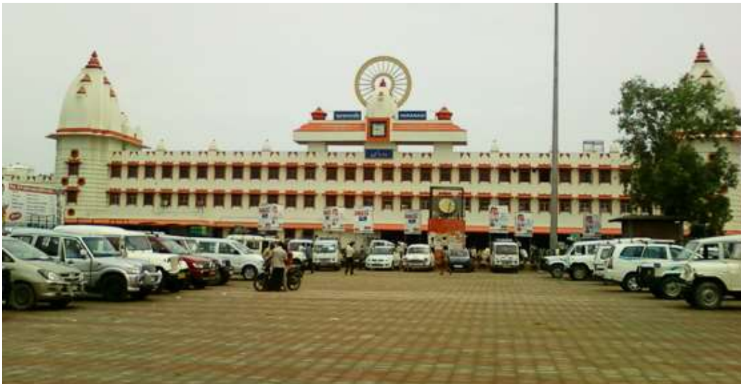
[Varanasi Junction, known as Cantt Railway Station]