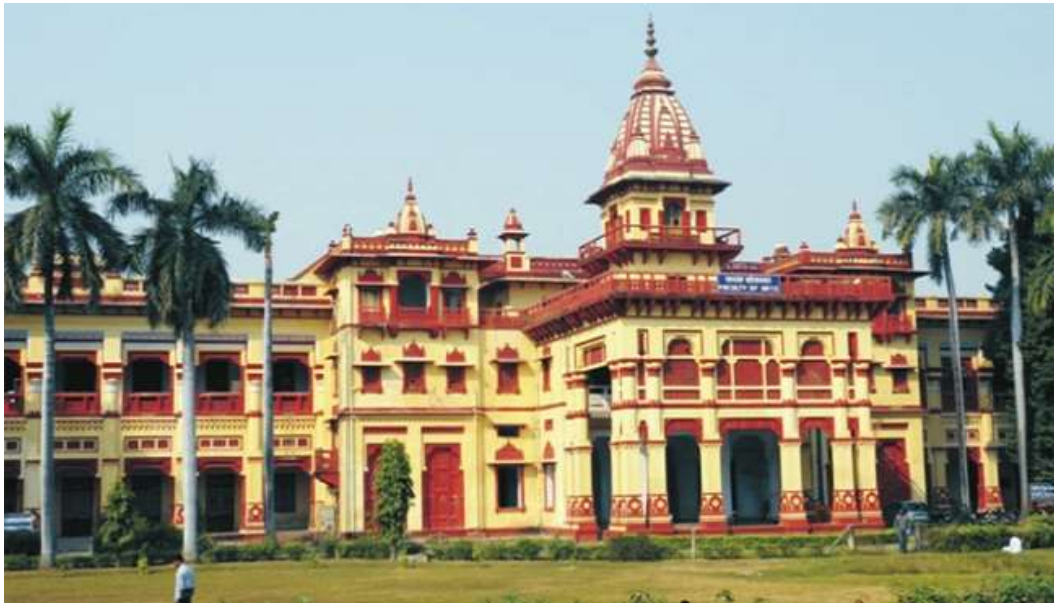
[Typical architecture of Banaras Hindu University buildings]